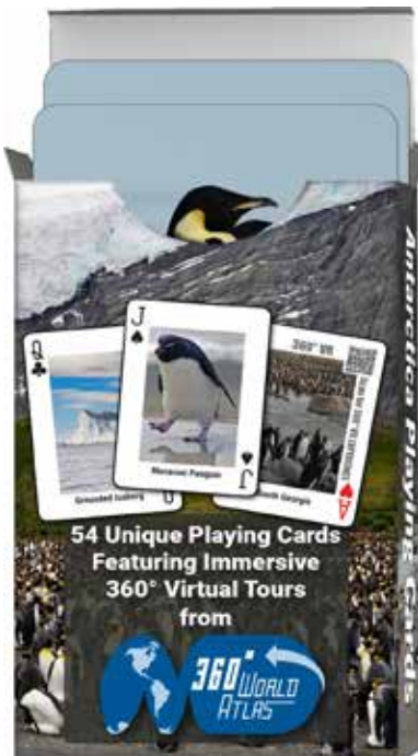
Back Of Box