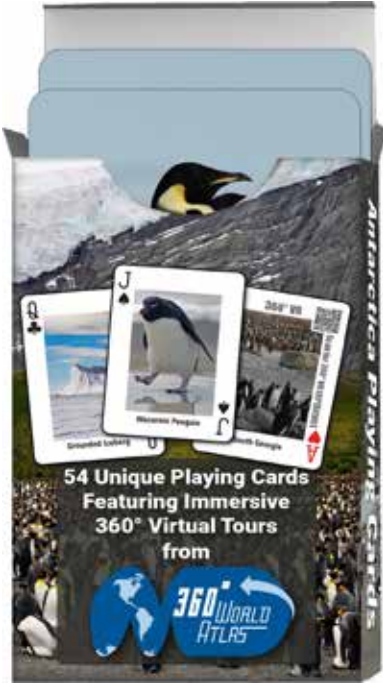
Back Of Box